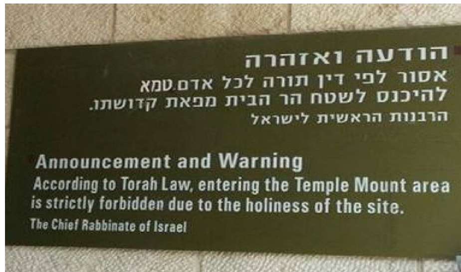
This sign near the Kotel was tampered with by activists who added the word 'טמא' into the Chief Rabbinate's ruling to give the impression that it WAS permitted for tehlorim to ascent. The sign was corrected and the word 'טמא' removed!