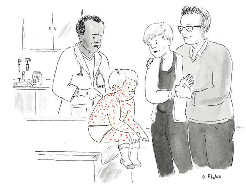
"If you connect the measles, it spells out 'My parents are idiots.'