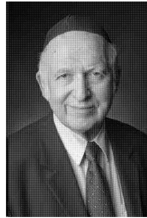
R' Aharon Lichtenstein