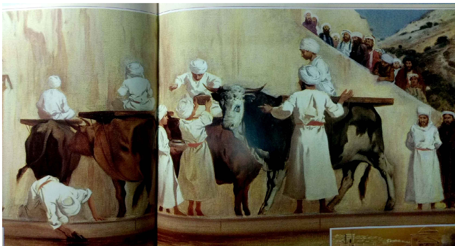
from Machon HaMikdash

The purpose of the wooden board was to act as an ohel to block any tumah (from an unknown dead body) while the ox was moving. The clear implication of this is that a moving ohel DOES work as an ohel!